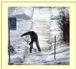
Shoveling snow is not easy work!

"Watering trees, shrubs and perennials may be necessary if the soil is dry from lack of snowfall."