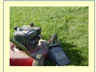
Proper mowing height means a greener healthier lawn

You don't have to guess what is going on in your lawn and trust me your neighbor doesn't know as much as he thinks. Call us so we can come out and diagnose the problem for you.