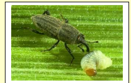
Can you identify this insect? You don't have to guess, ask us, we know.