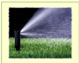
Proper adjustment means a green lawn

Please see Landscape Maintenance on page 4