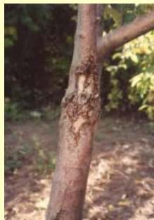
Deer damaged tree