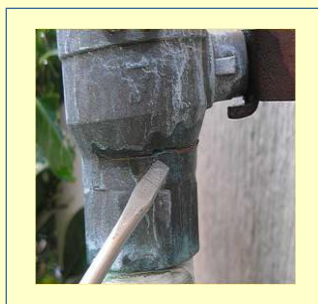
Winterize Now To Avoid This!

Thank you for taking the time to read our newsletter. We are looking forward to getting your lawn and home ready for winter.