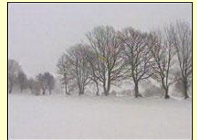
Snow is coming soon! We'll be glad to clear your drive and walkways.

Customers with signed contracts will take priority for removal over customers that call in with each snow. Contracts are being sent out now for review and approval. If you wish to be on our snow removal program, call now and request a snow removal contract for review.