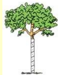
Example of a wrapped tree